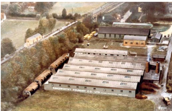
Kings Worthy Foundry about 1931. London Road runs across the top of the picture, the railway (now the A34) and station are to the left. The road frontage of the site is now Wessex Windows. Just to save you telling us, we realise that this is actually in Headbourne Worthy!

And this is where we would like your help!