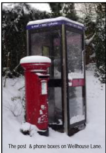
The post & phone boxes on Wellhouse Lane.

daffodils and primroses promise more delights. An ideal way to appreciate this and to explore is on foot and we do have a number of footpaths that allow for some marvellous views which would not otherwise be seen.