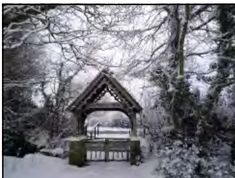
Photo: Looking through St Swithun's Lychgate onto Worthy Lane.

At the bottom you will cross another bridge and into the churchyard. If you chose the School Lane route, take a few minutes to enjoy the view from the bench across the field towards the church before entering the cemetery opposite Headbourne Worthy Grange and following the path down towards the church. From here go past the church and cross Worthy Road with care into Pudding Lane opposite, or alternatively, at the Lychgate at the bottom of the cemetery, follow the footpath through the woods to Worthy Road. Cross the road and turn left. Enjoy the views down the river and across Pudding Farm and look out for the deer and herons. Turn right into Pudding lane and follow the lane round and recross Worthy road, preferably at the crossing on the right, then recross Bedford Lane and turn right back to the start. If this walk will be too tiring then I would suggest that a few peaceful minutes on the bench in the cemetery off School Lane would be rewarding, especially when the spring flowers are in bloom – it really is a lovely spot – but mind the rabbit holes!